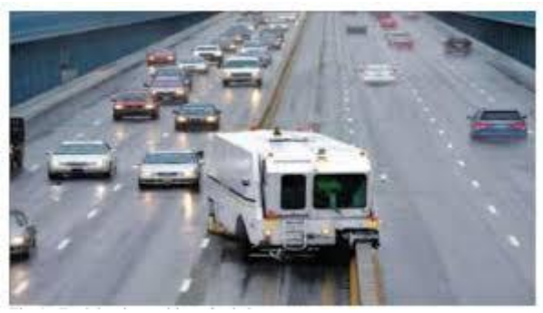
Fig 2. Road Divider using vehicle

The concept of movable road dividers was from the 90's, the reason was that there was traffic congestion from that period. At that period the machine was called as zipper machine, which is used to shift the divider from one lane to another lane. It was introduced in earlier 90's and the first working model of zipper machine was bought by Hawaii department of transport in late 90's. The machine contains a s-shaped inverted conveyor channel which lifts the barrier segment weighing almost 450kgs. The minimum length of the machine is 100feet. The barrier segment is attached to the machine and whenever there is traffic congestion the machine will move and along with the machine the barrier segment that contains the divider also moves resulting in the width of the lanes. In the proposed model, we are not using a machine and operating it manually rather operating it automatically by using two dividers namely normal and extended dividers. In this paper we place the ultrasonic sensor to one side of the road to detect whether there is any traffic congestion or not, if there is a congestion then the extended divider raises up and normal divider is set to ground level, else the normal divider is raised up and extended divider is set to ground level. And if there is congestion then a message is sent to the nearby traffic control police stating that traffic congestion has occurred. So this is simple and can replace the heavy machines.